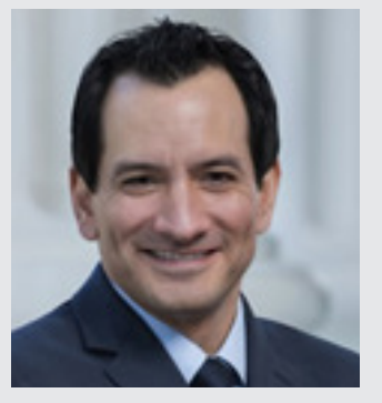
The Honorable Anthony Rendon, Speaker, California State Assembly