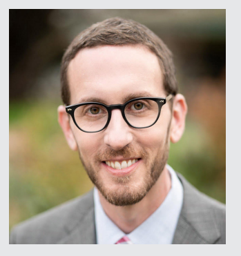
The Honorable Scott Wiener, Chair, California Senate Housing Committee