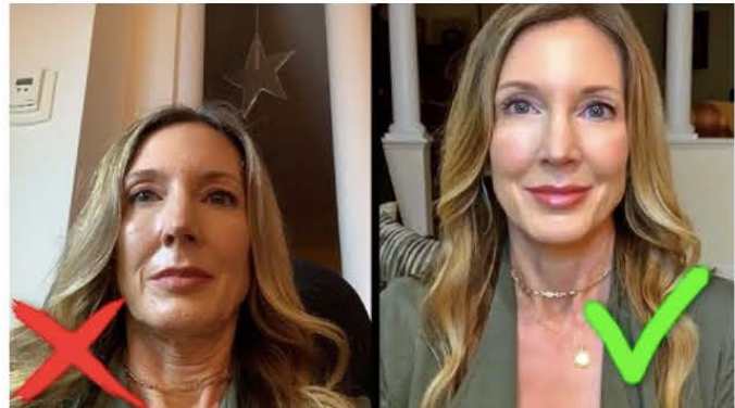
(Bad angle vs. Good angle)