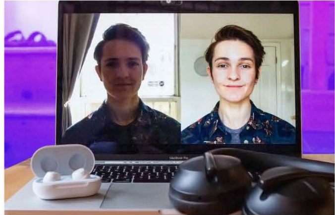
(Bad lighting vs. Good lighting)